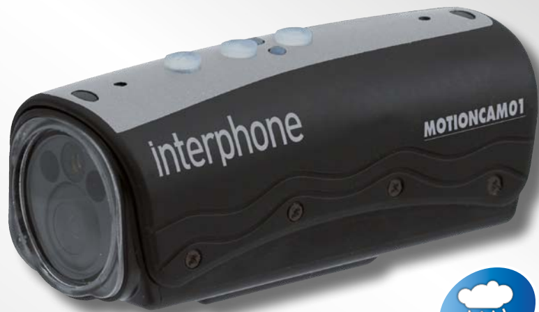
FULL HD ACTION CAMERA